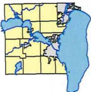
Winnebago County, Wisconsin