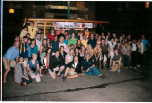
(Picture on Left is Pedal Tavern Driving over bridge. Right Picture is large group from Illinois whom rented 4 Pedal Taverns during 2012 season).