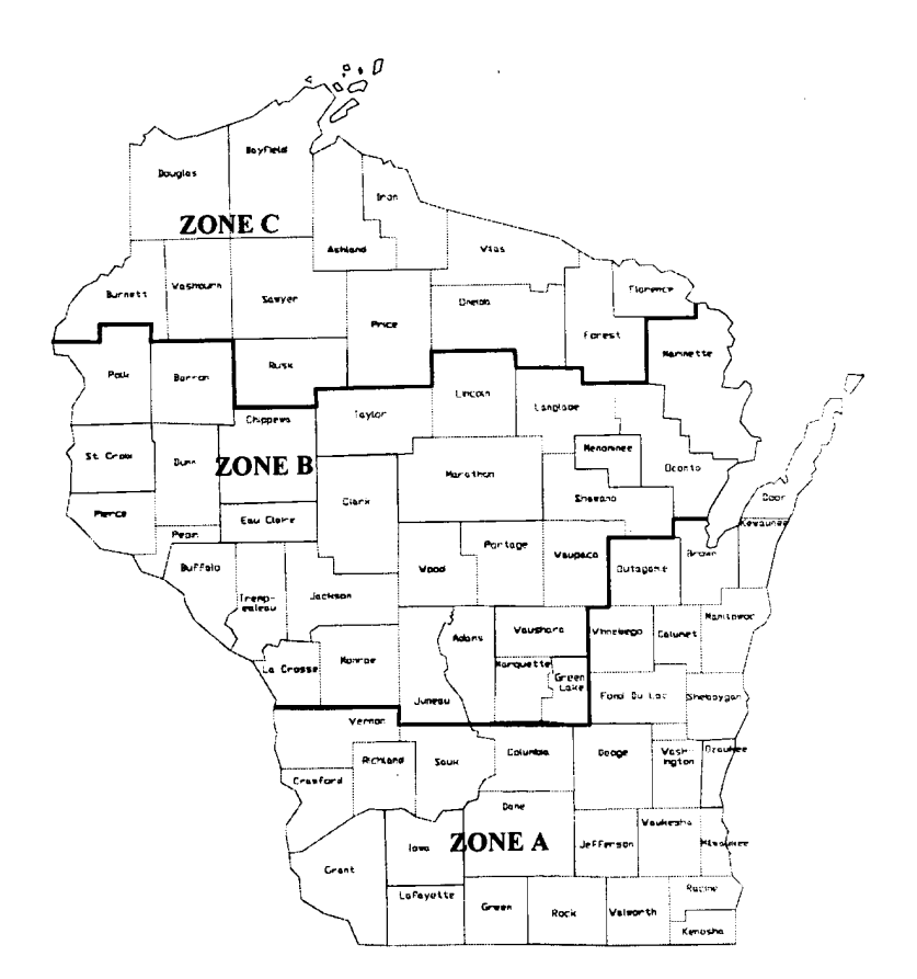
Figure 385.60–2 Latest Date to Begin Spring Soil Saturation Monitoring