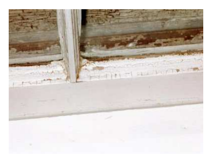
Chipping paint is deteriorated paint and must be repaired.

e. Chipping Paint. Paint chips are generally visible when chipping paint occurs. Chipping paint is paint that separates from the substrate due to either impact to the painted surface or poor surface preparation or paint failure.