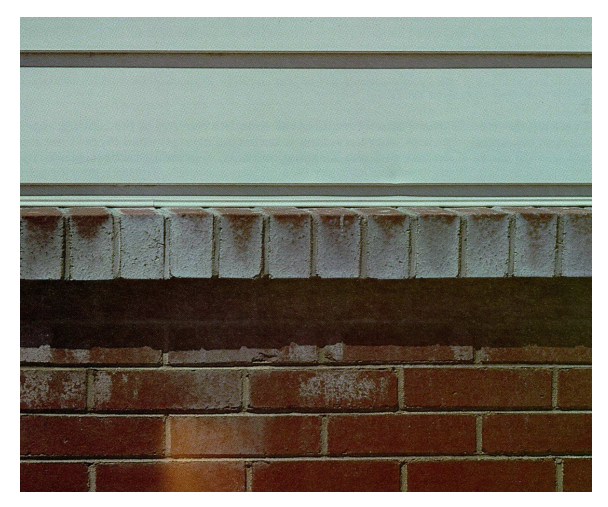
Chalking paint is deteriorated paint and must be repaired.

c. Chalking Paint. Chalking is the formation of a fine lead powder on the surface of a paint film. Almost all exterior oil paints are designed to eventually chalk in order to wash dirt away in the rain and provide a good surface for repainting. However, the chalking can also appear on the surfaces below the paint or on the ground. This chalking is usually caused by a failure to adequately prime or seal a porous surface, overthinning of paint, or exposure to sunlight.