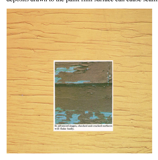
Flaking or scaling paint is deteriorated paint and must be repaired.

g. Flaking or Scaling Paint. Flaking is a form of paint separation often found in those exterior areas of the building susceptible to condensation, such as under the eaves. Salt deposits drawn to the paint film surface can cause scaling.