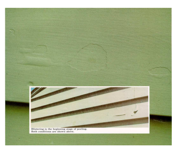
Blistering paint is deteriorated paint and must be repaired.

c. Chalking Paint. Chalking is the formation of a fine lead powder on the surface of a paint film. Almost all exterior oil paints are designed to eventually chalk in order to wash dirt away in the rain and provide a good surface for repainting. However, the chalking can also appear on the surfaces below the paint or on the ground. This chalking is usually caused by a failure to adequately prime or seal a porous surface, overthinning of paint, or exposure to sunlight.