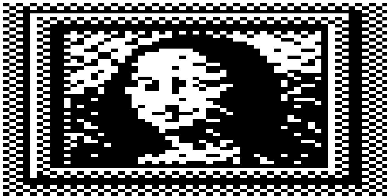
Figure 34.23 SYSTEMS OF BLOCKS

History: Cr. Register, February, 1992, No. 434, eff. 3-1-92; CR 01-139: am. (2) (a) Register June 2002 No. 558, eff. 7-1-02; CR 02-127: am. (1), (2) (a), (b) and (4) Register May 2003 No. 569, eff. 6-1-03; correction in (2) (a) made under s. 13.92 (4) (b) 7., Stats., Register February 2008 No. 626; CR 08-054: renun. (1) and (2) (a) to be (1) (a) and (2), cr. (1) (b), r. (2) (b) and (c), r. and recr. (4) Register December 2008 No. 636, eff. 1-1-09.