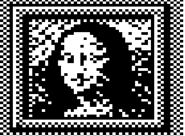
History: Cr. Register, April, 1992, No. 436, eff. 5-1-92.

NR 811.68 Separation of water mains and other contamination sources. (1) Proposed water mains shall be adequately separated from any potential source of contamination. The following minimum horizontal separation distances shall be maintained: