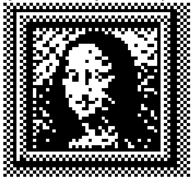
History: Cr. Register, April, 1992, No. 436, eff. 5-1-92.