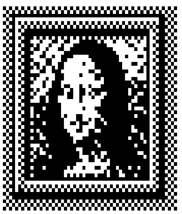
FIGURE NO. 4

(3) Hoses may not be contaminated by contact with the ground.