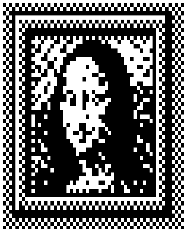
FIGURE NO. 1

History: Cr. Register, April, 1992, No. 436, eff. 5-1-92.