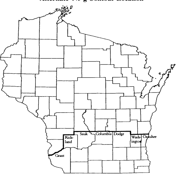
History: CR 00-179: cr. Register December 2001 No. 552, eff. 7-1-02.

Comm 62.1616 Seismic design category. This is a department exception to the requirements in IBC section 1616.3: The seismic design category is permitted to be determined from IBC Table 1616.3(1) alone when all of the following apply: