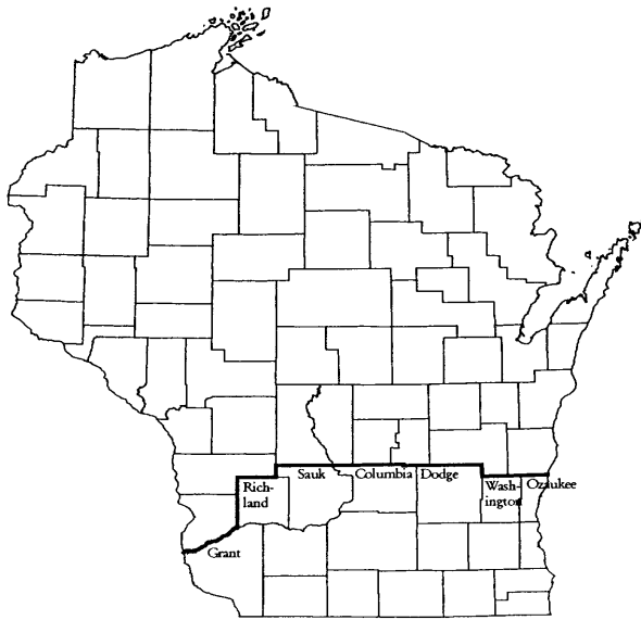
Figure 62.16-2 Alternate 4% g Contour Location

History: CR 00-179: cr. Register December 2001 No. 552, eff. 7-1-02.