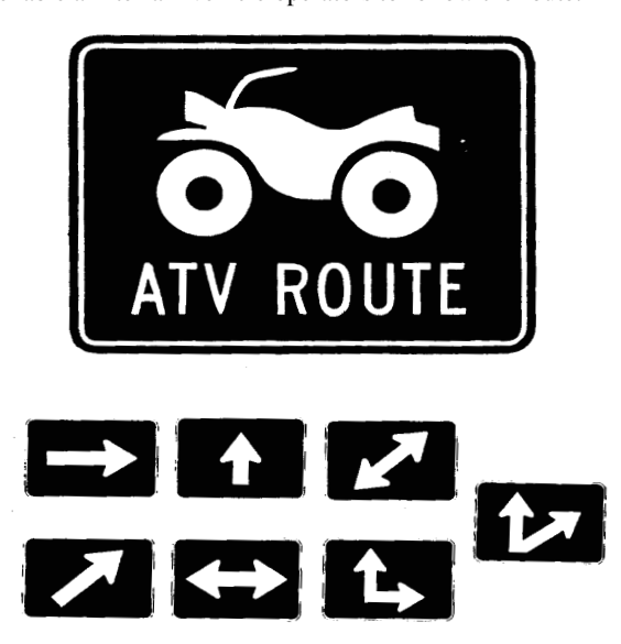
ALL TERRAIN VEHICLE ROUTE SIGN AND ARROWS (M-7 SERIES)