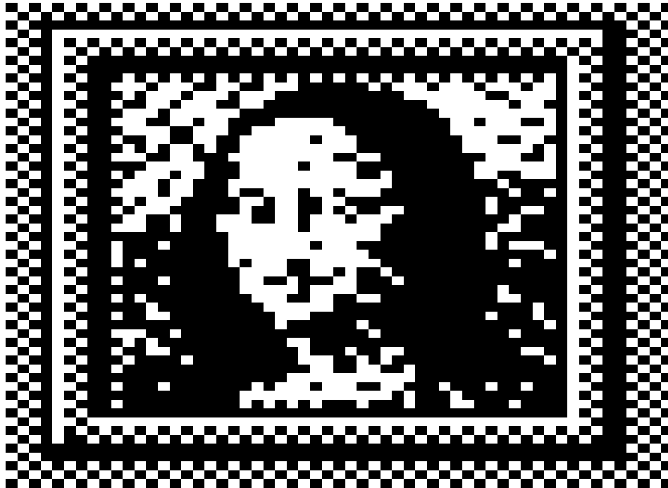
Figure 34.23 SYSTEMS OF BLOCKS

(c) Each piece of material used in a system of blocks shall be level and oriented so its height does not exceed the width of its base.