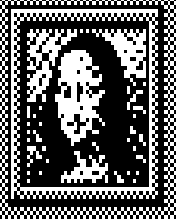
FIGURE NO. 1

History: Cr. Register, April, 1992, No. 436, eff. 5–1–92.