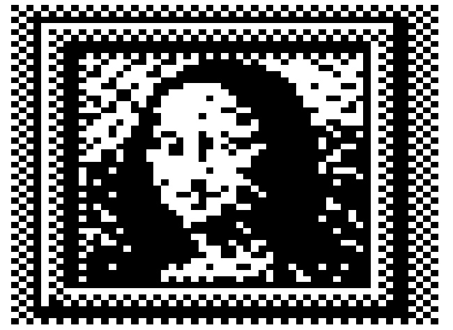
History: Cr. Register, April, 1992, No. 436, eff. 5-1-92.

NR 811.68 Separation of water mains and other contamination sources. (1) Proposed water mains shall be adequately separated from any potential source of contamination.