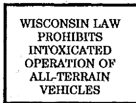
INTOXICATED OPERATION SIGN

2. The all-terrain vehicle symbol for permissive and restrictive signs shall be the same as under subd. 1.