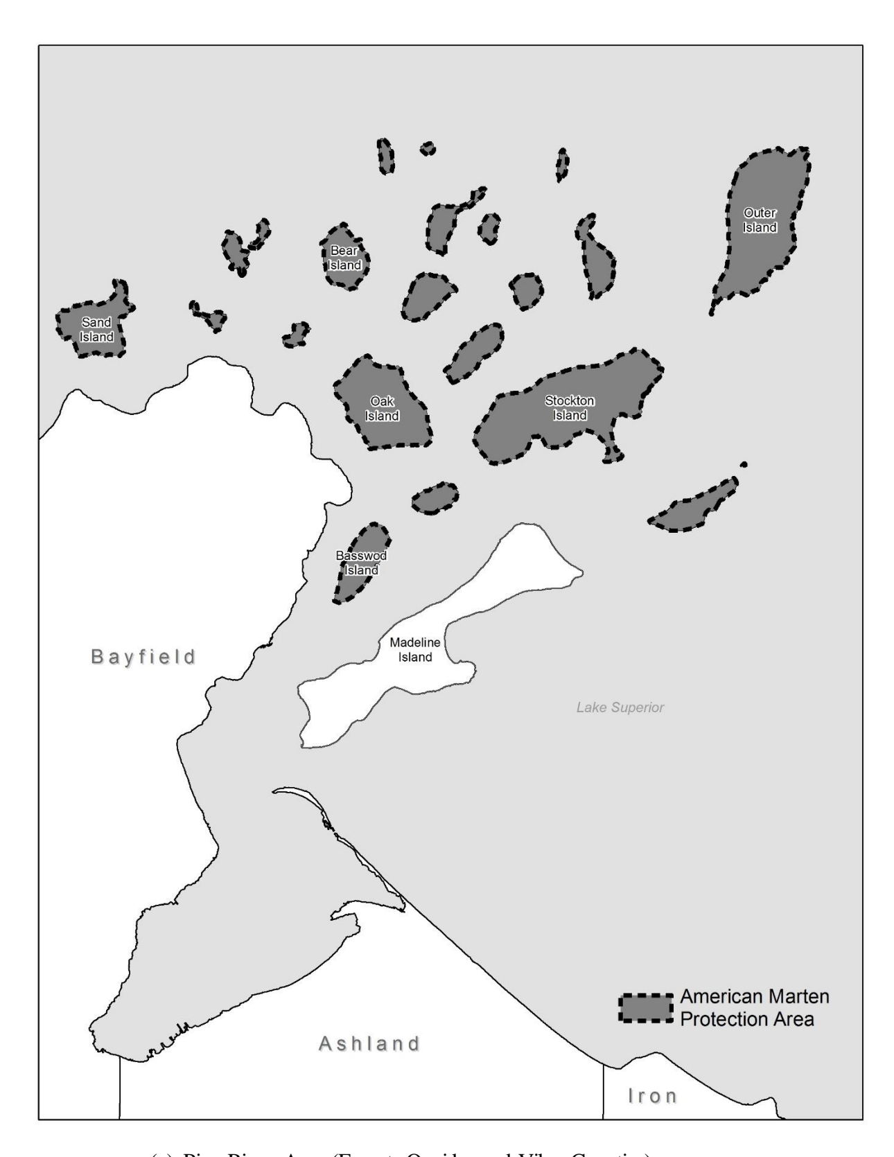
(c) Pine River Area (Forest, Oneida, and Vilas Counties)