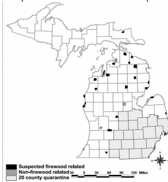
Figure 1. 2005 Map of infestations of emerald ash borer and probable source of infestation.