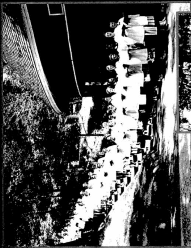
▲ College Camp Choir, 1938.

▶ Lewis Auditorium was located in a central location on the George Williams College campus.