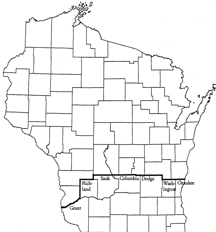
Figure 62.16-2 Alternate 4% g Contour Location

Comm 62.1621 Component certification. The requirements in IBC section 1621.3.5 are not included as part of this code.